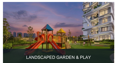
LANDSCAPED GARDEN & PLAY